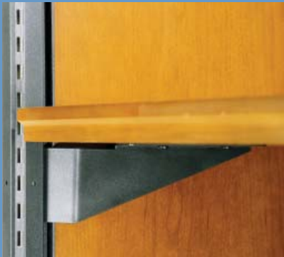
Pavilion's adjustable work surface bracket.