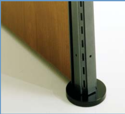
Metal glides provide a durable end to the connecting post.