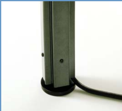
Pavilion's power leg provides electrical and data to the floor.