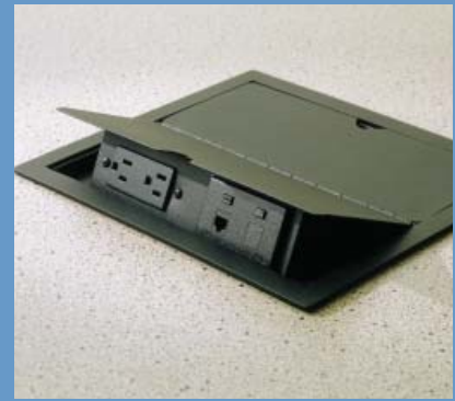
Optional double-faced power/data outlet center.