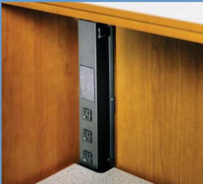
Power column can also be equipped with data. Pavilion is UL listed.