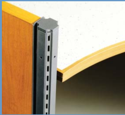
Patented universal cruciform connecting posts provide the reconfigurability and adjustability factors.