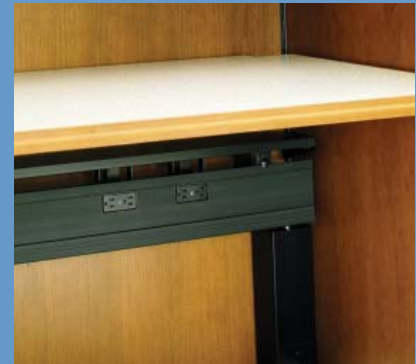
J-Channel manages and distributes electrical and data.